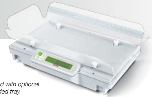
Pictured with optional four-sided tray.