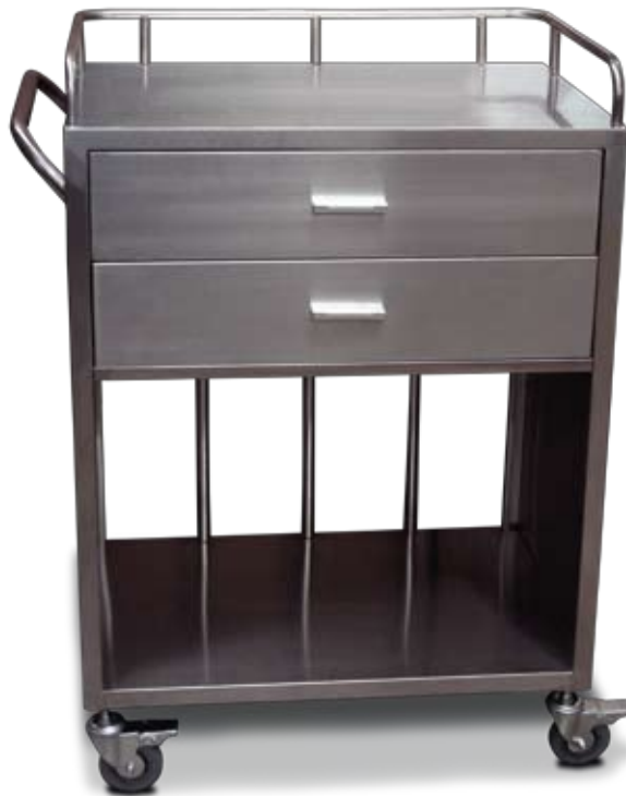
Optional stainless steel cart.